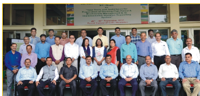
The participants of training course for IFS Officers

FSI imparts training to forestry personnels working at various levels in State Forest Departments to sensitize them with the latest advancements in application of Remote Sensing & GIS for preparation of Working Plans, GPS Applications in Forest Survey and Demarcation, Application of GIS in Forest Resource Management etc. The following courses were conducted during the period September, 2016 - December, 2016.