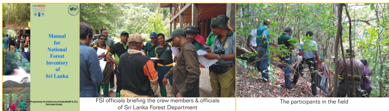
FSI officials briefing the crew members & officials of Sri Lanka Forest Department

A one-week training programme was organised at FSI, Dehradun for Sri Lankan officials from 26-12-2016 to 30-12-2016 on "Data Processing". Fourteen Sri Lankan trainees participated in the training. They were given training on NFI design of Sri Lanka, process of generation of sample points, Field Manual prepared for NFI of Sri Lanka, description of NFI field forms, Data Entry Module, hands on exercise, data checking and processing etc.