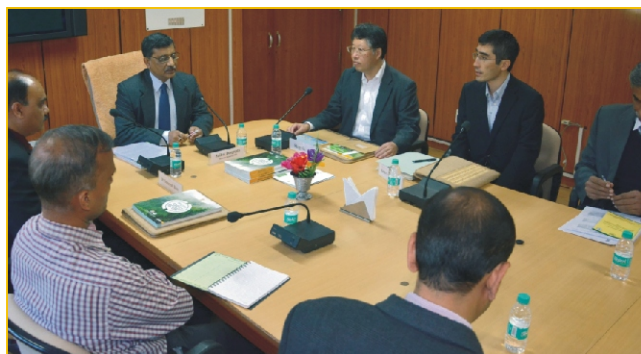
Meeting between the Japan delegation & officers of FSI & under the Chairmanship of DG, FSI

A Joint Working Group was constituted under the guidelines of Memorandum of Cooperation (MoC) in the field of Forest and Forestry signed between the MoEF&CC, Government of India and the Ministry of Agriculture, Forestry and Fisheries, Japan. As per the Memorandum of Cooperation (MoC), periodical meetings will be held in respective countries annually to discuss and exchange views to draw a road map for enhancing cooperation in the field of sustainable forest management, HRD, forest conservation, biodiversity, effective utilization of