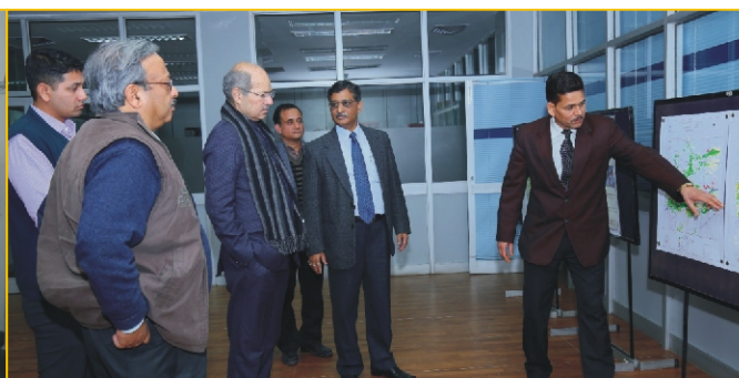
The Hon'ble Minister reviewing the methodology of Forest Fire Monitoring