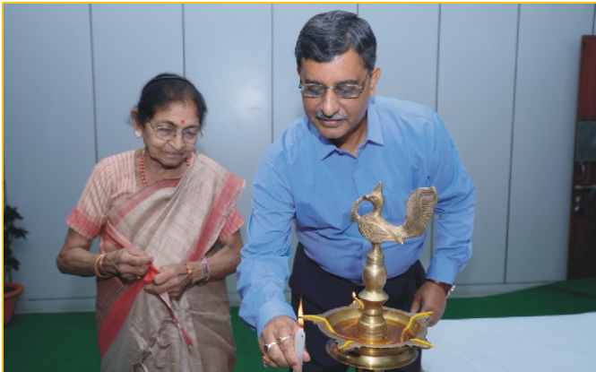
हिंदी सप्ताह के दौरान काव्य गोष्ठी का उद्घाटन करते हुए महानिदेशक महोदय