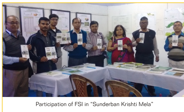
Participation of FSI in “Sunderban Kristi Mela”

इस कार्यालय में हिन्दी पखवाडा का आयोजन दिनांक 14 से 28 सितम्बर, 2016 तक आयोजित किया गया। इस दौरान कई कार्यक्रम व प्रतियोगिताएँ आयोजित की गई एवं विजेता प्रतिभागियों को पुरस्कार वितरण किए गए। राजभाषा कार्यन्वयन समिति की तिमाही बैठक क्रमशः दिनांक 30 सितम्बर 2016 से 30 दिसम्बर 2016 को आयोजित की गई। इन बैठकों में हिन्दी के प्रगामी प्रयोग से संबंधित विषय पर चर्चा की गई तथा हिन्दी के अधिकाधिक प्रयोग पर बल दिया गया।