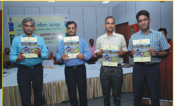
भारतीय वन सर्वेक्षण की वार्षिक राजभाषा पत्रिका 'वन दर्पण' का विमोचन करते हुए महानिदेशक महोदय तथा अन्य अधिकारी