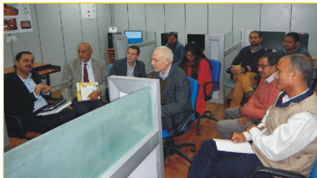
The World Bank team holding a meeting with FSI Officials

The members of the World Bank team emphasised the need for a more robust system of forest system dissemination of burnt scar assessment & pre-